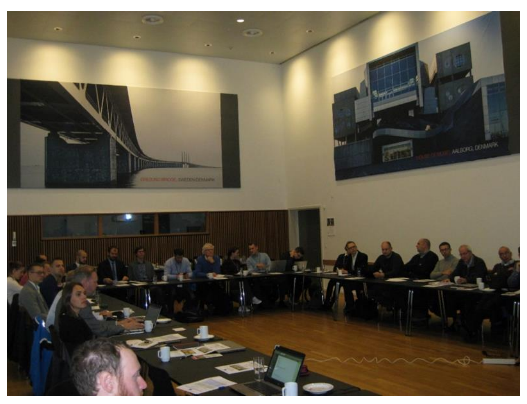
Figure 3: Welcome speech and introduction to the workshop at COWI