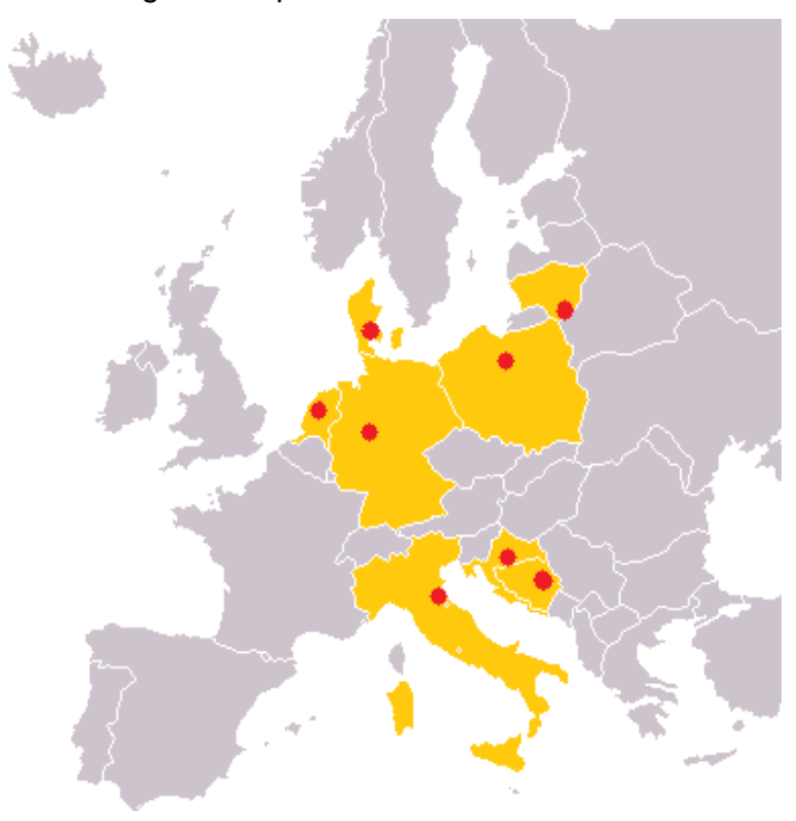
Figure 1: Upgrade DH target countries and demo cases

The overall objective of the Upgrade DH project, funded by the EU's Horizon2020 programme, was to improve the performance of inefficient district heating networks in Europe by supporting selected demonstration cases for upgrading, which can be replicated in Europe. The Upgrade DH project supported the upgrading and retrofitting process of DH systems in different climate regions of Europe, covering various countries. The target countries of the Upgrade DH project are: Bosnia-Herzegovina, Denmark, Croatia, Germany, Italy, Lithuania, Poland, and The Netherlands. In each of the target countries, the upgrading process is initiated at concrete DH systems of the so-called Upgrade DH demonstration cases (demo cases) (Figure 1). The gained knowledge and experiences were further replicated to other European countries and DH systems in order to leverage the impact.