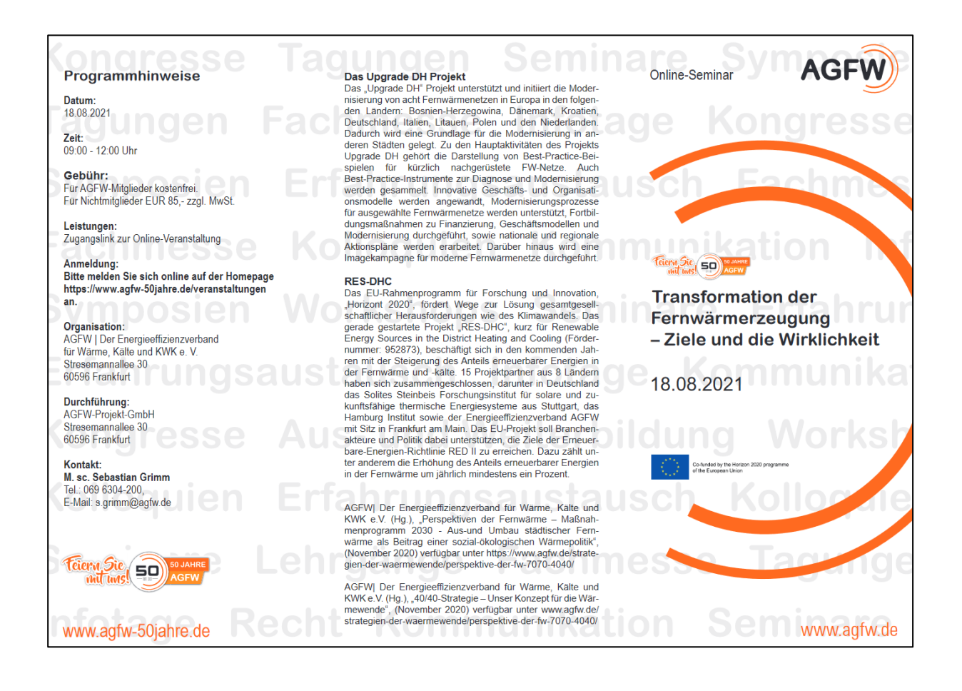
Figure 6: Announcement of the WS within the 50 years of AGFW event series (<u>https://www.agfw-50jahre.de/veranstaltungen</u>)