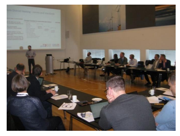
Figure 4. Presentation of the new plastic pipes introduced in COOL DH project