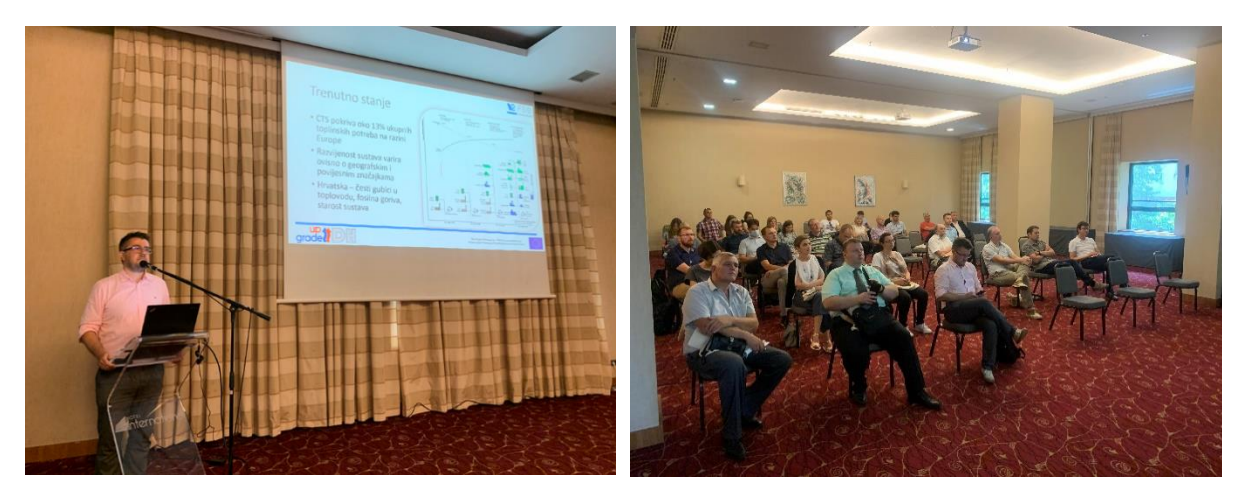
Figure 2 Workshop in Croatia