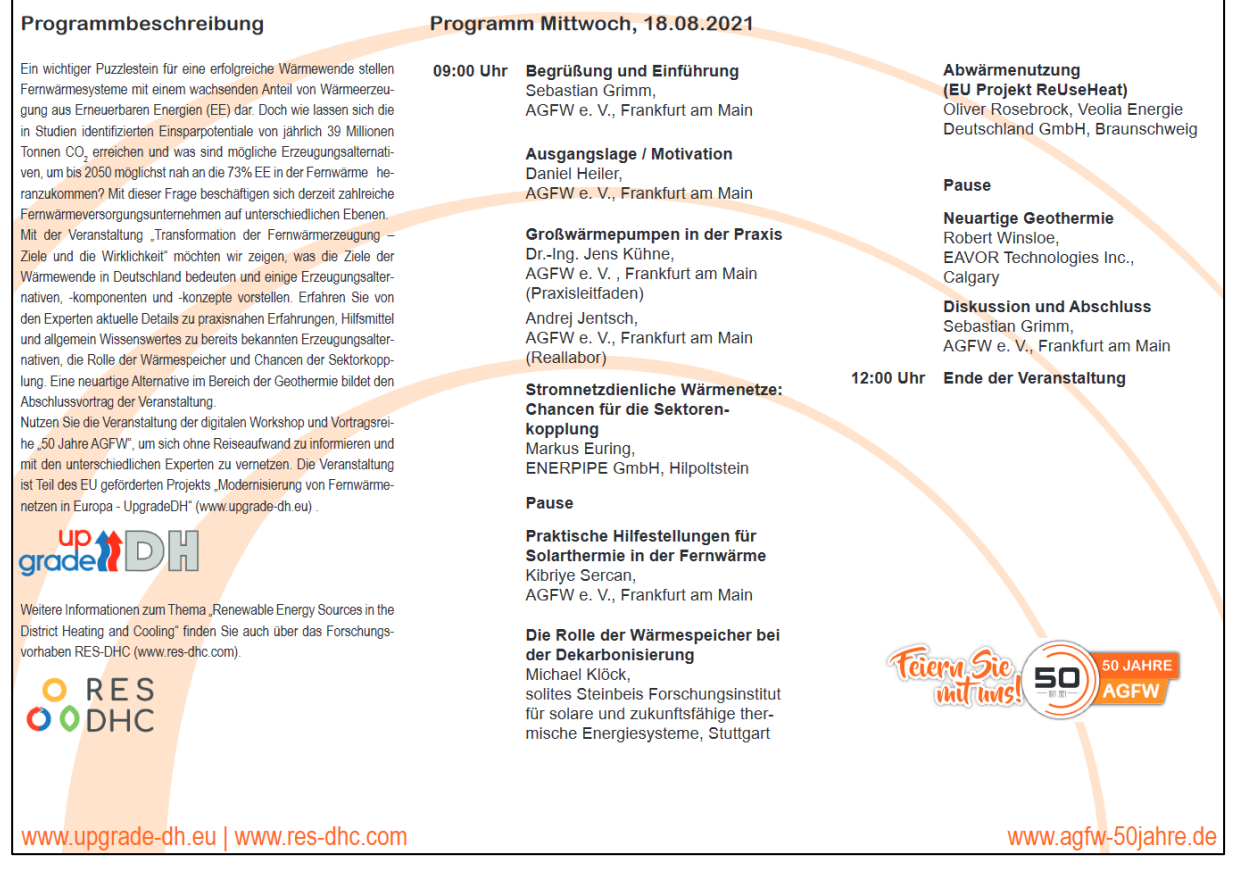
Figure 7: Programme flyer of Expert WS